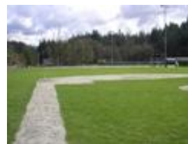
New left Field Extension at Myrtle Park.