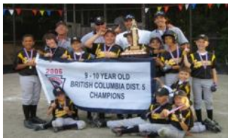
2006 District Five 9-10 Division Champion Mt. Seymour